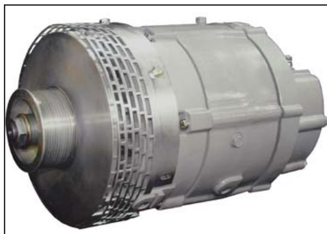
Right: PennTex Industries PX-833 24-Volt Air-Cooled 50DN-Style Alternator