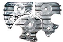
Rectifier Heat Sinks (3)

Also includes a Insulator & Accessory Kit and a Hardware Kit