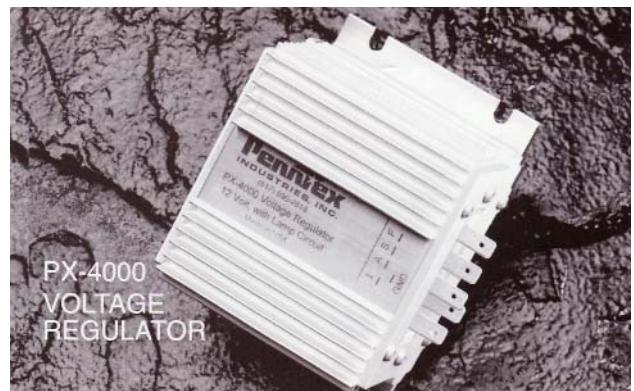
PX-4000 VOLTAGE REGULATOR