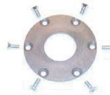
Outer DE Bearing Retainer & Mounting Screws