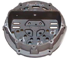
Rectifier End Frame