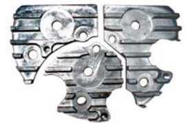
Rectifier Heat Sinks (3)

Also includes a Insulator & Accessory Kit and a Hardware Kit