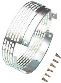
Fan Shroud & Mounting Hardware