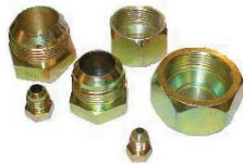
Oil Line Cap Kit