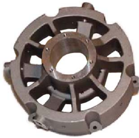
Drive End Frame

PX-8 BCK Conversion Kit 50DN oil-cooled to PX-8 air-cooled