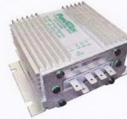
PX-4000 VOLTAGE REGULATOR