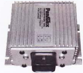
PX-7000 VOLTAGE REGULATOR