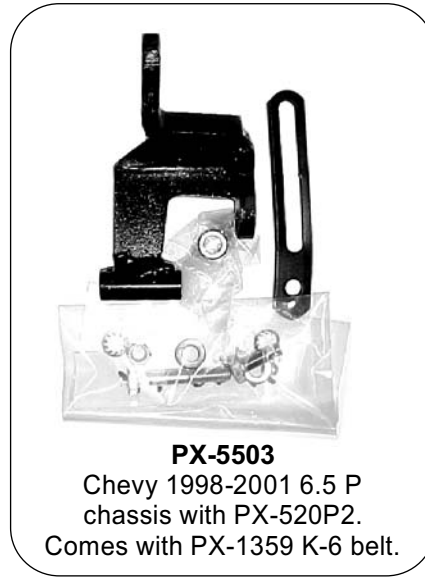
PX-5503 Chevy 1998-2001 6.5 P chassis with PX-520P2. Comes with PX-1359 K-6 belt.