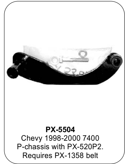
PX-5504 Chevy 1998-2000 7400 P-chassis with PX-520P2. Requires PX-1358 belt