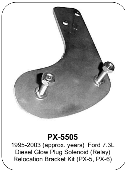
PX-5505 1995-2003 (approx. years) Ford 7.3L Diesel Glow Plug Solenoid (Relay) Relocation Bracket Kit (PX-5, PX-6)