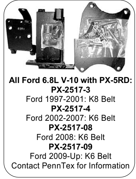
All Ford 6.8L V-10 with PX-5RD: PX-2517-3 Ford 1997-2001: K8 Belt PX-2517-4 Ford 2002-2007: K6 Belt PX-2517-08 Ford 2008: K6 Belt PX-2517-09 Ford 2009-Up: K6 Belt Contact PennTex for Information