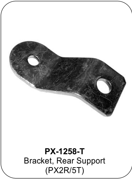
PX-1258-T Bracket, Rear Support (PX2R/5T)