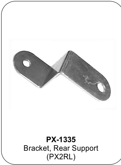
PX-1335 Bracket, Rear Support (PX2RL)