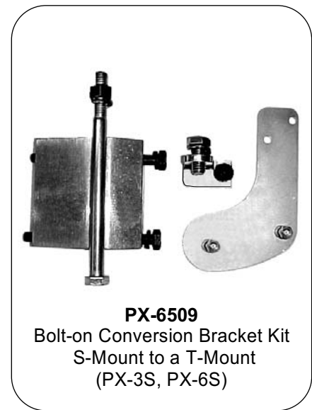
PX-6509 Bolt-on Conversion Bracket Kit S-Mount to a T-Mount (PX-3S, PX-6S)