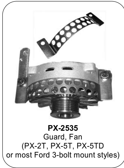
PX-2535 Guard, Fan (PX-2T, PX-5T, PX-5TD or most Ford 3-bolt mount styles)