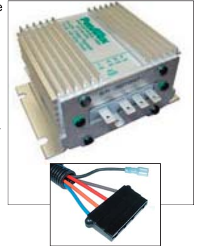
Connector for PX-4000, PX-5000, & PX-6000 Regulator

Click Here for a copy of the PennTex Warranty Claim Form.